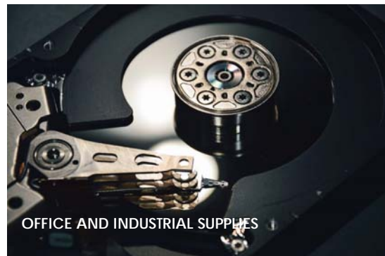
OFFICE AND INDUSTRIAL SUPPLIES